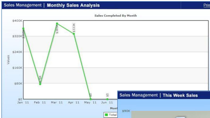
Fast Illustration for Completed Sales by Month

Reports are configured for individual user content and by permission Group Report content. Click on the Chart Report Name to view results.