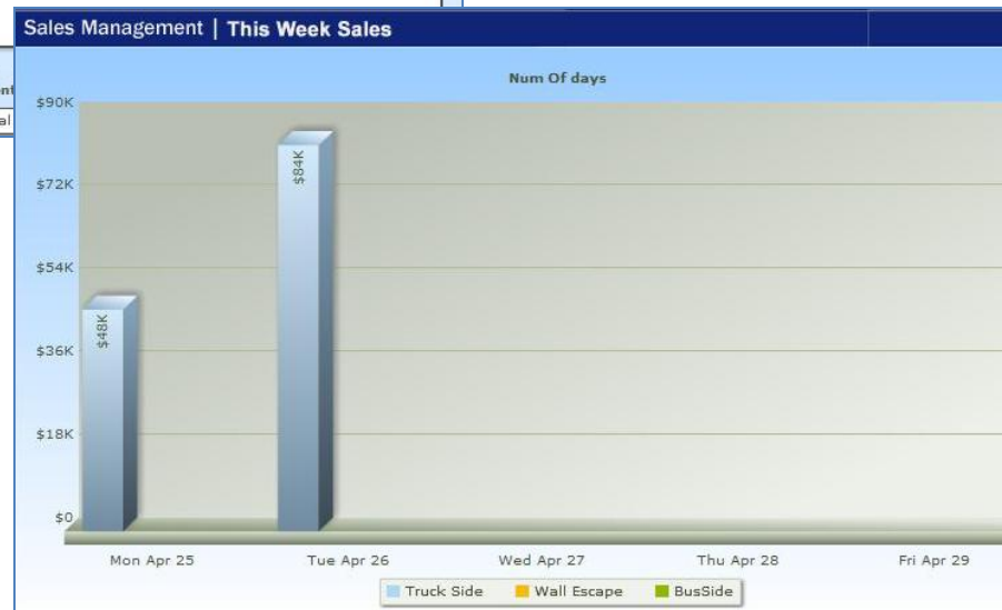
Completed Sales This Week Analysis